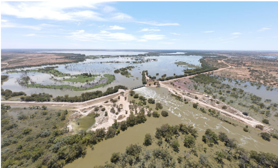
Image: Menindee main weir and surrounding water 14.01.23

What also makes the current flood unique is that it is the third successive major flood surge in the past year.