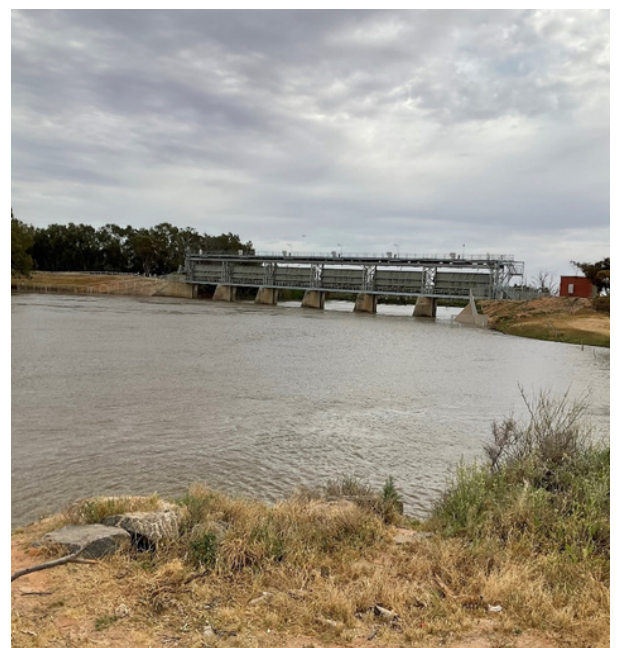
Water flowing through Menindee Lakes main weir 20.01.23

WaterNSW started to decrease water releases, as the inflows started to recede. These actions created 56 gigalitres of airspace while continuing to hold back as much water as possible, as significant amounts of water still entered the system.