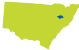
LOCALITY DIAGRAM NSW

Keepit Dam is situated on the Namoi River, 56km west of Tamworth and 39km north-east of Gunnedah on the north-west slopes of the NSW Northern Tablelands. Entry is free and the dam grounds are open 24 hours a day, all year round. Visitors are encouraged to visit the Tolcumbah lookout just south of the dam wall for excellent views of the wall, lake and the surrounding countryside. Public access to the dam wall is not permitted from April 2017 until late 2020 due to construction from the Keepit Dam Upgrade, however a viewing and turning area is available on approach to the main wall.